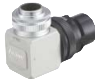
L-0544 TV CAMERA ADAPTER(f=100mm)

The L-0240 ZOOM MAGNIFICATION SLIT LAMP provides practitioners with the utmost satisfaction thanks to its excellent image clearness and fine design.