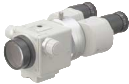
ZS-3-SL ZOOM MAGNIFICATION SYSTEM (10X-30X, OBJECTIVE LENS f=100 mm)