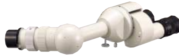
L-0542-C ASSISTANT BINOCULAR MICROSCOPE