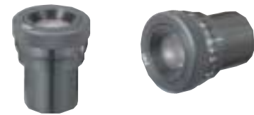
OCL-009 EYE PIECES 15X