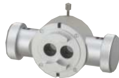
L-0541 BEAM SPLITTER