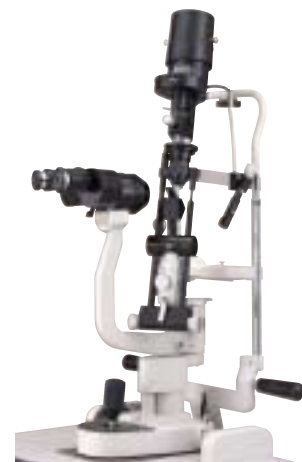
L-0185 GREENOUGH TYPE SLIT LAMP