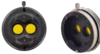
YF-57 SPECIAL ADAPTOR BUILT-IN YELLOW FILTER