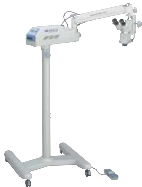
L-0980M MANUAL ZOOM OPERATION MICROSCOPE GIGA